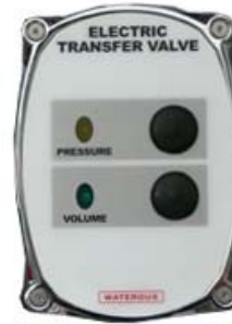
Transfer Valve Switch: Permits easy control of valve position

A mechanical override provision which may be connected to a control at the panel, permits manual transfer valve operation. Available with choice of top or bottom mounted actuator.