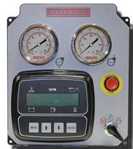
New Control Module